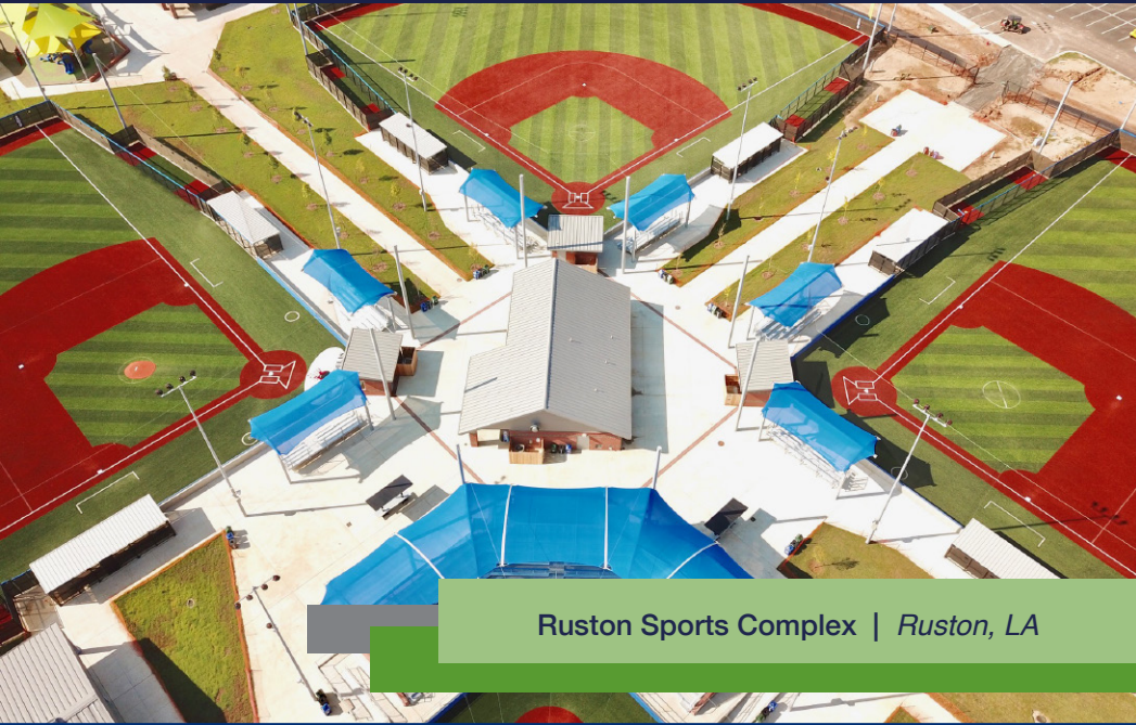
Ruston Sports Complex | Ruston, LA