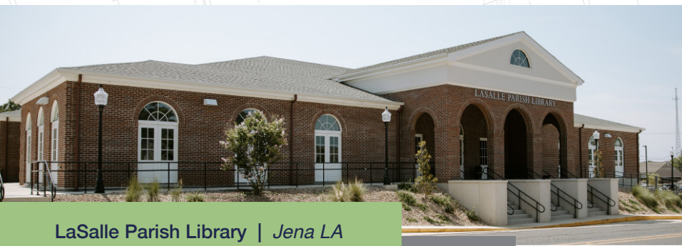
LaSalle Parish Library | Jena LA