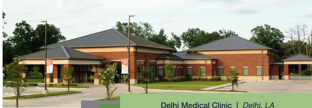
Delhi Medical Clinic | Delhi, LA

We can handle what your project requires. Whether you elect to embark on a design build or a construction management project delivery system, we will perform all preconstruction services, prepare subcontractor or trade packages, and communicate at all stages to ensure projects stay on schedule and within budget. We ensure timely scheduling with a focus on "speed of delivery" while maintaining attention to detail. Our operation is trusted and dependable.