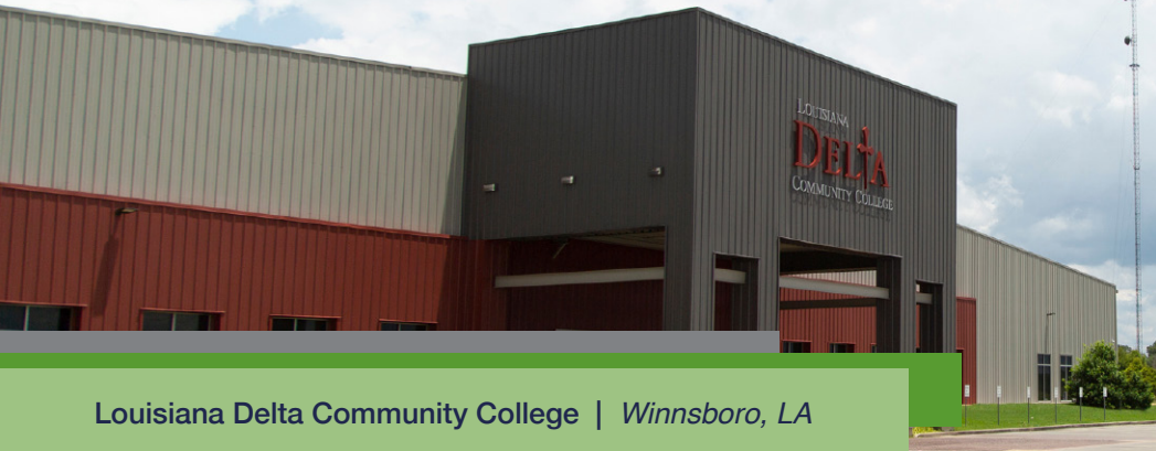
Louisiana Delta Community College | Winnsboro, LA